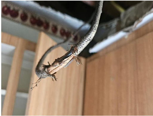
1933-3 Wire Sheathing Typical Interior