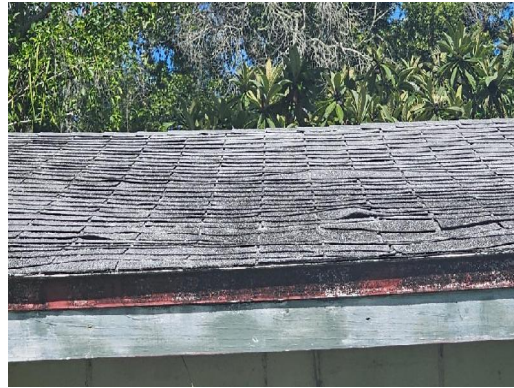
1933-4 Asphalt Shingle/Bulk Material Typical Exterior Roof