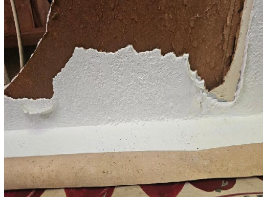
1933-2 Drywall/Joint Compound Typical Interior Walls/Ceilings