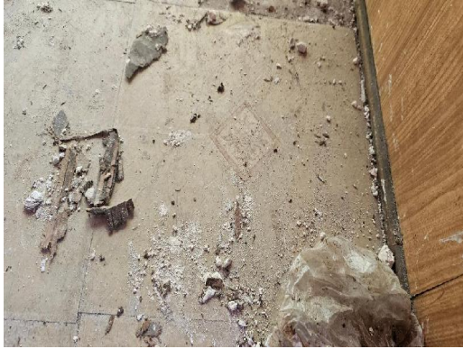
1933-1 12"x12" Floor Tile/Adhesive Interior Kitchen